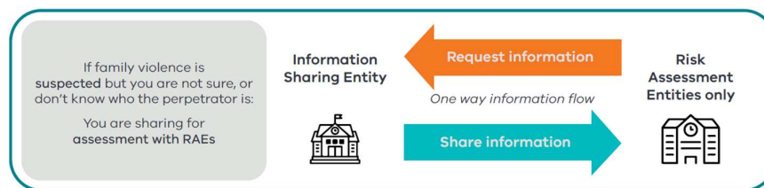
Figure 1: Overview of activities when sharing information for risk assessment

Family violence risk assessment is an ongoing process and is required at different points in time from different service perspectives. Education and care services will have a role in working collaboratively with other services to contribute to ongoing risk assessment and management of family violence.